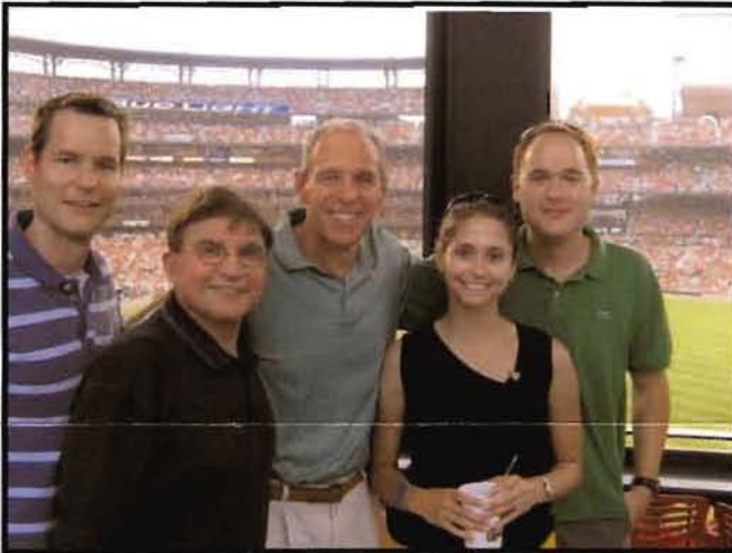
Apices participants enjoying St. Louis baseball