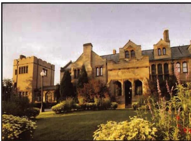
The Cranwell Lennox, Massachusetts-August 6-10, 2008

The formal program will cover such topics as regenerative endodontics, clinical measures of endodontic regeneration and implementation of such procedures into your practice.