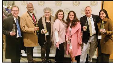
BRC Board of directors toasting to a successful BRC with Texas Ranch Water.