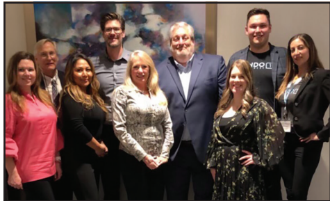
Huge thank you to our sponsors ASI Dental Specialties, Brasseler, Endo1 Partners, Endo Mastery, EdgeEndo, Global Surgical, Seiler Instrument, TDO, and US Endo Partners.