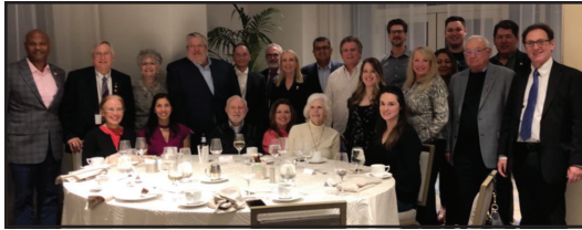
BRC Appreciation dinner

The 13th Annual COD Board Review and Scientific Update (BRC) was held at the University of Texas Health Science Center at Houston School of Dentistry, PACE Center from February 3-5, 2023. It was our first in person BRC since 2020 where over 3,000 CE credits were awarded to 150 attendees. Eleven expert speakers covered topics to help prepare candidates challenging the upcoming American Board of Endodontics' certification examinations, provided Diplomates and dentists Endodontic updates and continuing education credits needed for recertification. Topics ranged from vital pulp therapy, surgical endodontics to Oral exam preparation.