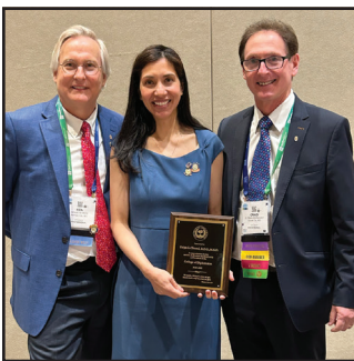
The 97 new diplomates were presented with a COD commemorative Chicago Pin.